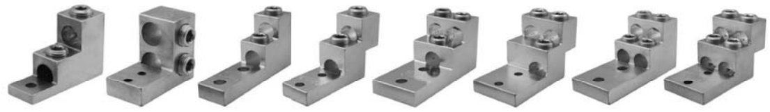
Fig. 1 Fig. 2 Fig. 3 Fig. 4 Fig. 5 Fig. 6 Fig. 7 Fig. 8